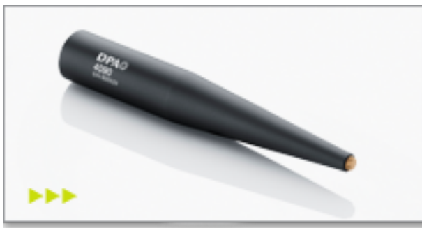
Typical on-axis frequency response of DPA 4090 in free field