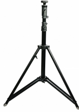
FOS Stand Led Follow Spot 350/600

Flight case with wheels for Led Follow Spot 350.