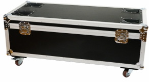
FOS Case Led Follow Spot 350

Flight case with wheels for Led Follow Spot 350.