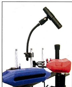
Works with instrument microphones. SCX-1c is pictured.