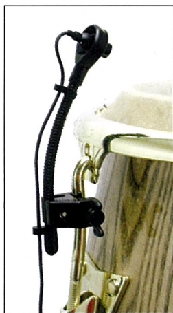
Works with Micro-D (pictured) and other miniaturized mics

The bottom line is that experimentation is ultimately the key to achieving the best results for each application. For more ideas, contact Audix and request a copy of our Microphone Application Guide.