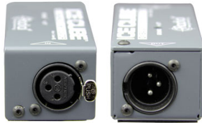
Click to view larger image