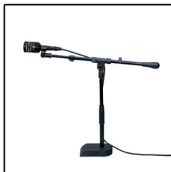
D6 on KD-STAND